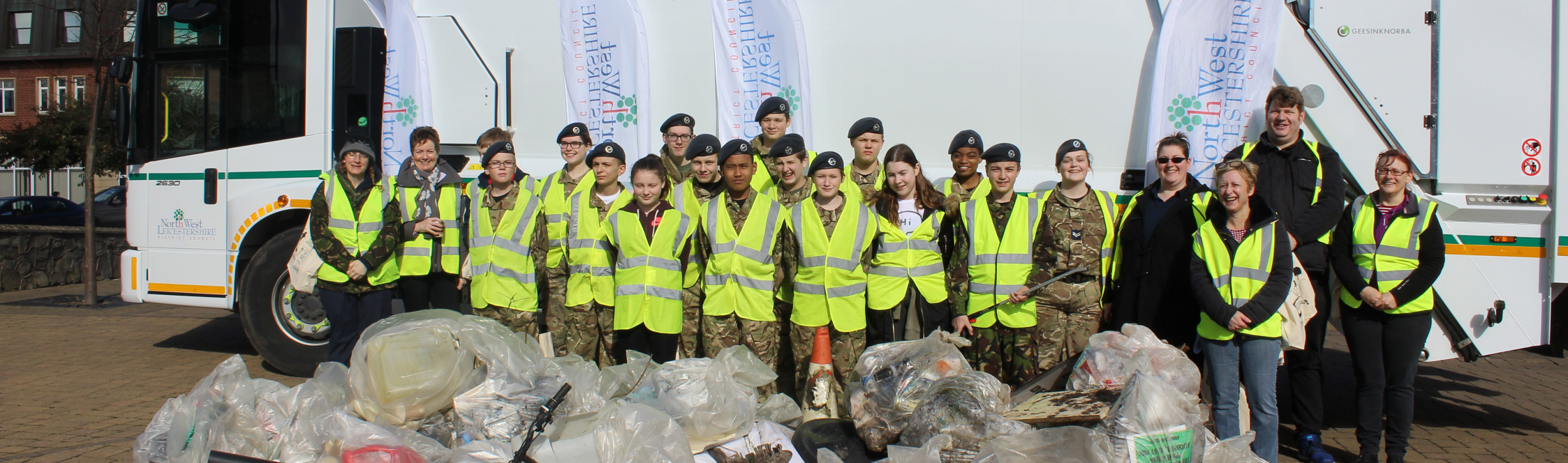
Coalville Spring Clean, March 2017