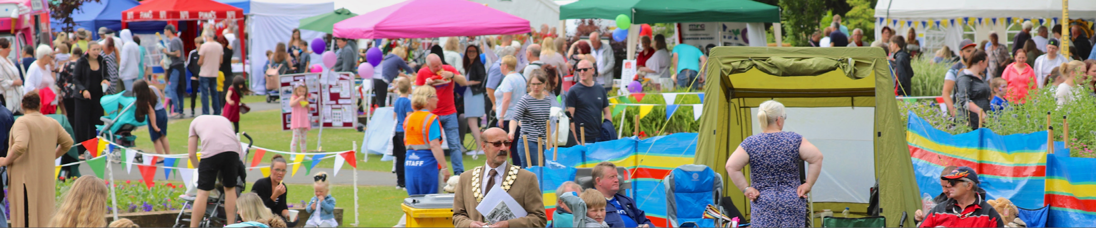
Picnic in the Park 2017