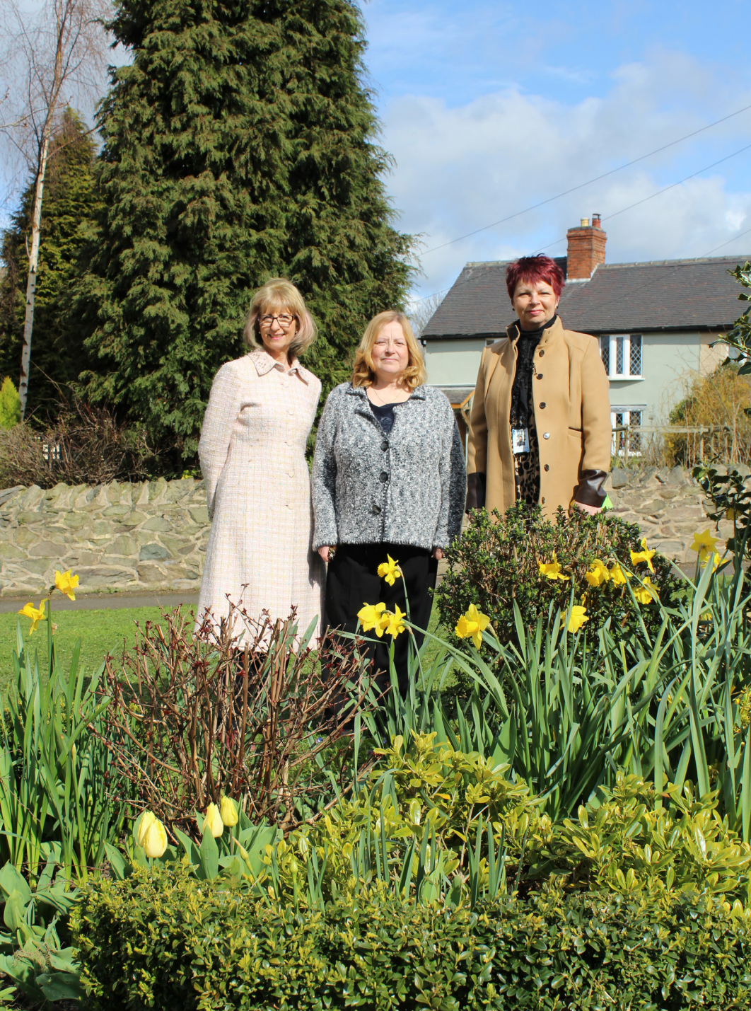
Green Shoots grants