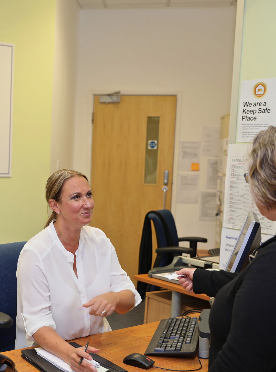
Reception, Council offices