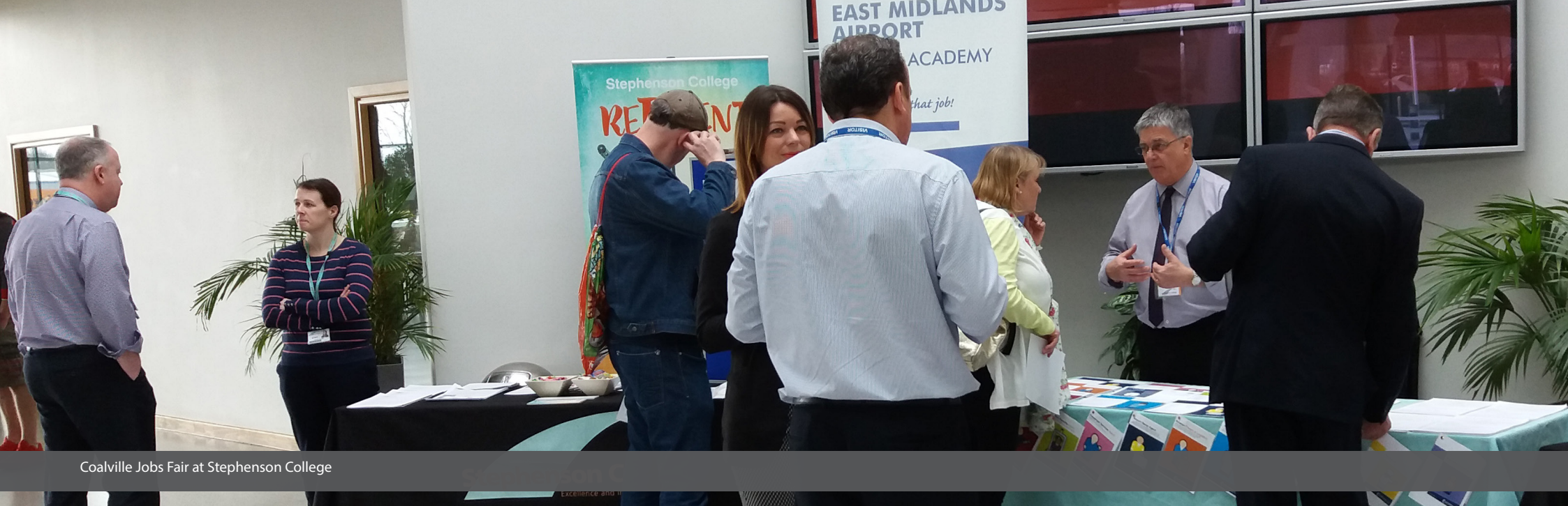
Coalville Jobs Fair at Stephenson College